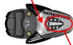
Din scale up to 7, 8, or 9